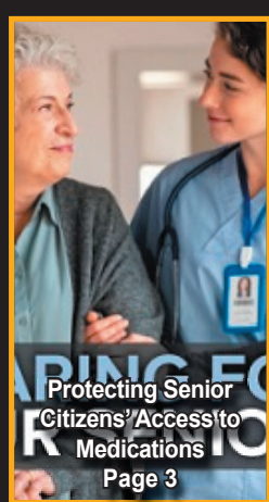
Protecting Senior Citizens' Access to Medications Page 3