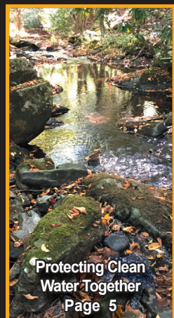
Protecting Clean Water Together Page 5