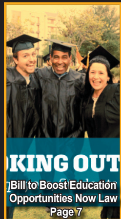
WORKING OUT Bill to Boost Education Opportunities Now Law Page 7