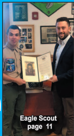
Eagle Scout page 11