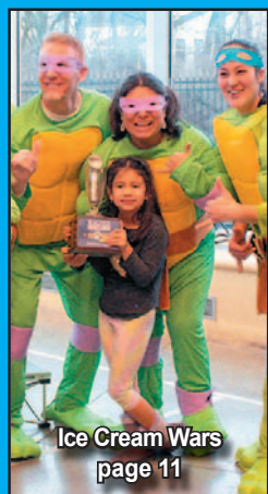
Ice Cream Wars page 11