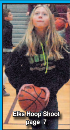
Elks Hoop Shoot page 7