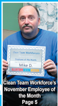
Clean Team Workforce's November Employee of the Month Page 5