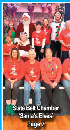
Slate Belt Chamber 'Santa's Elves' Page 7