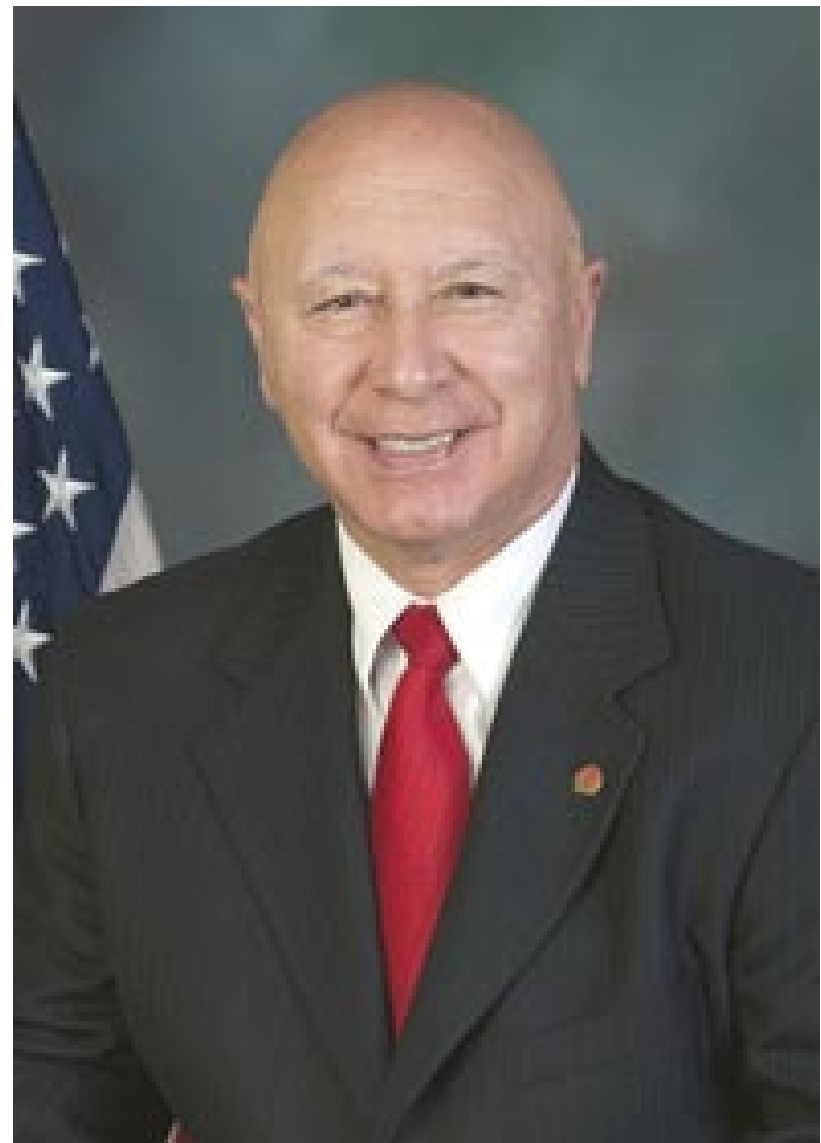
Senator Mario Scavello (R-40)