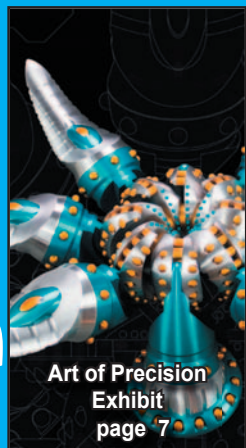
Art of Precision Exhibit page 7