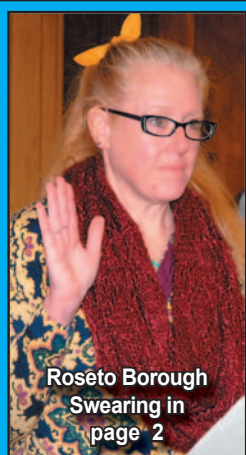
Roseto Borough Swearing in page 2