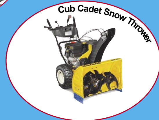
Cub Cadet Snow Thrower

Our selection of off-road and lawn equipment includes Polaris ATVs, Ranger utility vehicles, and snowmobiles; Ski-Doo snowmobiles; Husqvarna power equipment and mowers Can-Am ATVs, Spyders and UTV's; Scag Commercial Mowers; Cub Cadet lawnmowers and tractors; Yamaha generators and pressure washers.