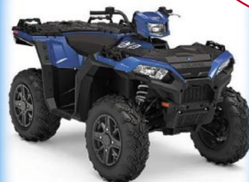
2020 Polaris Sportsman® XP 1000

HELP WANTED Sales and Parts Apply Within