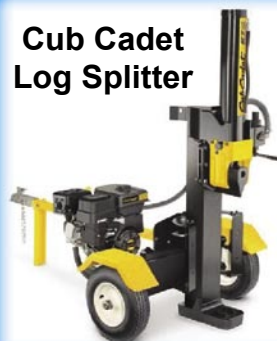
Cub Cadet Log Splitter