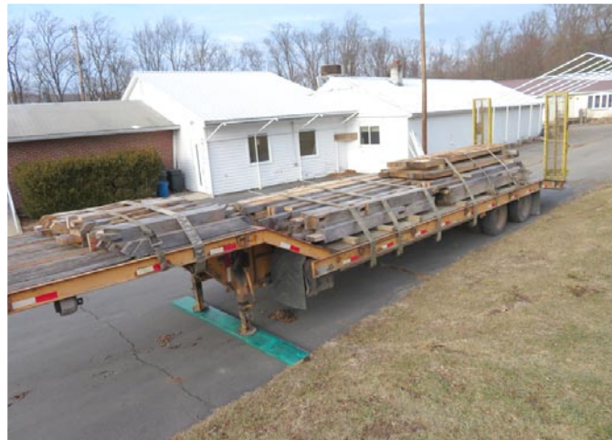
The timber frame components were loaded up at Totts Gap Arts where everything was prepared for the project