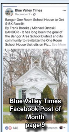
Blue Valley Times Facebook Post of Month page 9