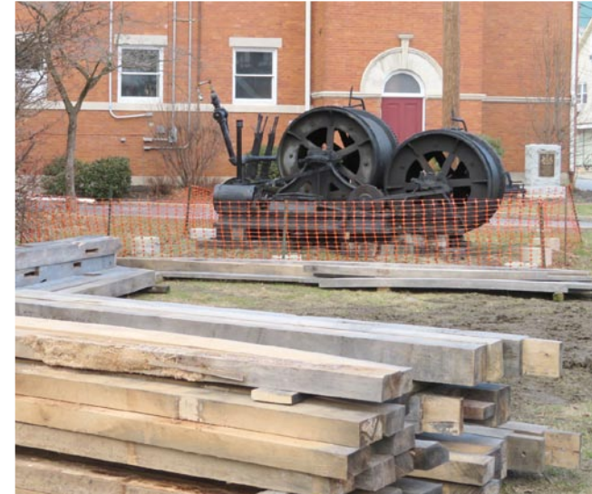
The timber frame components were delivered to the park in historic downtown Bangor this weekend where they will be assembled over the quarry hoist