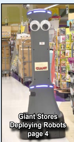
Giant Stores Deploying Robots page 4