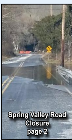
Spring Valley Road Closure page 2