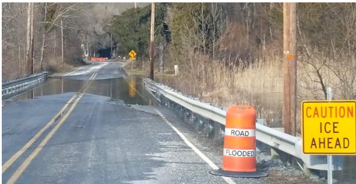
Record high precipitation over the past year has caused flooding on County Route 659 (Spring Valley Road) in Hardwick Township, prompting Warren County to close the road to all through traffic. County officials are working with state and local authorities and organizations on a solution.