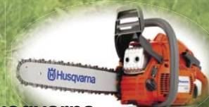
Husqvarna Chain saw