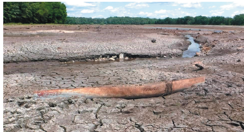
Temple University's team concrete canoe found by Friends of Minsi Lake in 2017 when it was drained for new dam to be built

day! Friends of Minsi Lake (FOML) found their canoe embedded in the lakebed when it was drained in 2017 for the dam rehab project. Between the park board meeting minutes & 35mm slides from the day of the 1982 event, parks staff were able to solve this 42-year-old mystery!