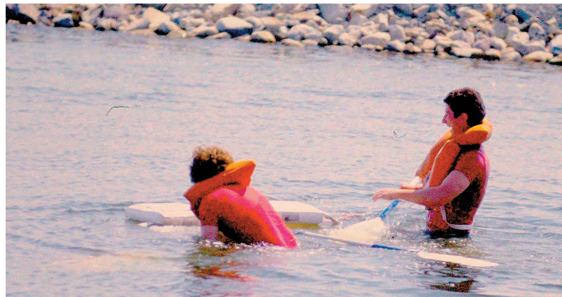
Temple University's team concrete canoe competition gone wrong

Apparently Temple University's team were the big losers of the