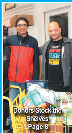
Donors Stock the Shelves Page 8