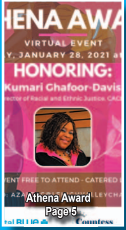
Athena Award Page 5