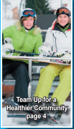
Team Up for a Healthier Community page 4