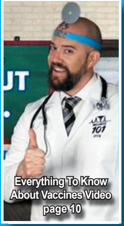
Everything To Know About Vaccines Video page 10