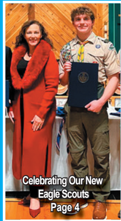
Celebrating Our New Eagle Scouts Page 4