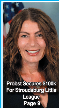
Probst Secures $100k For Stroudsburg Little League Page 9