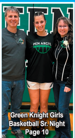
Green Knight Girls Basketball Sr. Night Page 10