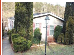
LAKE CHICOLA ADULT COMMUNITY ** RANCH IN BLUE MOUNTAIN VILLAGE. This home has 3 bdrm, 2 1/2 bath and overlooks the lake. Very roomy and amenities include use of lake, clubhouse, water, sewer and road maintenance. MLS#597958 $55,000