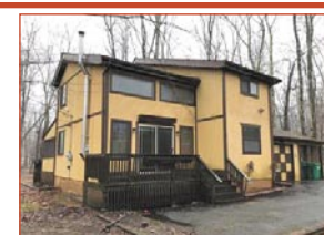
CLASSIC CONTEMPORARY! This 3BR, 2BA home has Vaulted ceilings, loft area, wood/coal stove, galley style kitchen w/ newer appliances and dining area opening up to a 3- seasoned screened in-room overlooking level rear yard. MLS#598527 $99,900