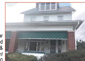
PEN ARGYL BEAUTY- Great in-town location on corner lot W/ 1-car garage. Hardwood floors, crown molding, wood trim & beautiful leaded glass windows! Kitchen features new SS appliances. Spacious living & dining room, attic, full basement plus wraparound porch! MLS#598774 $179,900