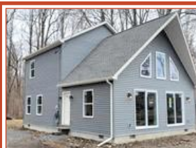
BEAUTIFUL NEW CONSTRUCTION IN HIGHLY DESIRABLE LAKE COMMUNITY. This newly constructed 3 bed/3 bath chalet style home offers brand new Mitsubishi heat pump/central air unit, brand new septic system w/ 2 year service warranty, lg front deck, 200 amp service and MORE! MLS#598332 $269,900

Post member Gene Tragiani presented Menhennit with a certificate for the all his hard work to complete the project and said "behind every Eagle Scout are supporting parents" referring to Menhennit's parents Tom and Nannette who were in the audience.