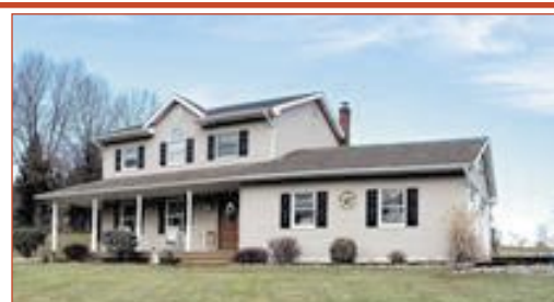
MODERN COLONIAL HOME, in pristine condition, boasts 4+ sprawling acres! Lustrous hardwood flooring, nice-sized dining/kitchen combination, spacious living room, 3 bedrooms and 2 full bathrooms. Vast views, open fields, a sizable paver patio, attached 2 car garage, natural borders, additional utility sheds, and appealing wrap around porch complete the inviting feel that is this home! MLS#598408 $289,900