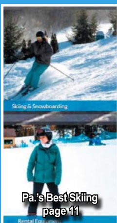
Skiing & Snowboarding Pa.'s Best Skiing page 11