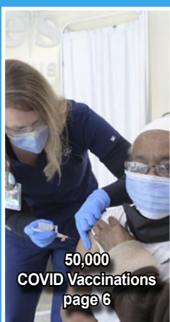
50,000 COVID Vaccinations page 6