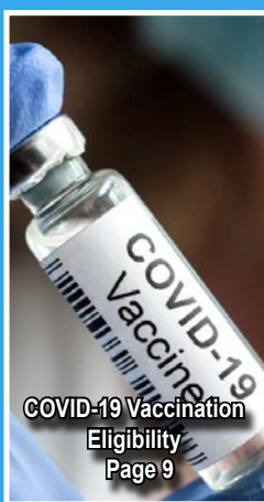
COVID-19 Vaccination Eligibility Page 9