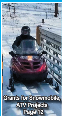
Grants for Snowmobile, ATV Projects Page 12