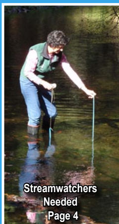
Streamwatchers Needed page 4

Carmen J. Mariano July 16, 1948 - February 10, 2021 page 2