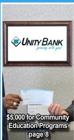
$5,000 for Community Education Programs page 8