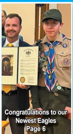
Congratulations to our Newest Eagles Page 6