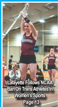
Lafayette Follows NCAA Ban On Trans Athletes In Women's Sports Page 13