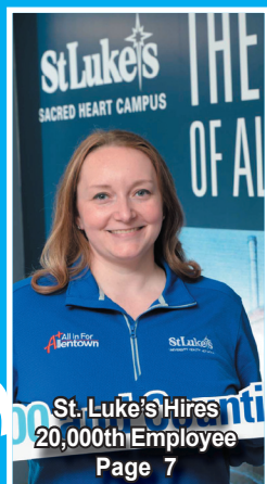
St. Luke's Hires 20,000th Employee Page 7