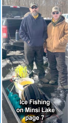
Ice Fishing on Minsi Lake page 7