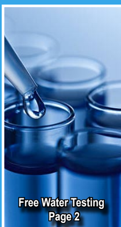
Free Water Testing Page 2