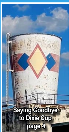
Saying Goodbye to Dixie Cup page 4