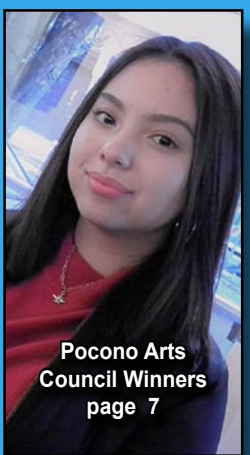
Pocono Arts Council Winners page 7