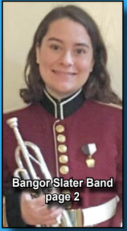
Bangor Slater Band page 2