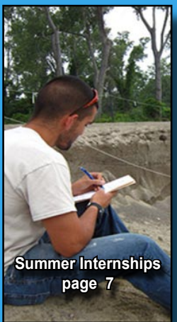
Summer Internships page 7