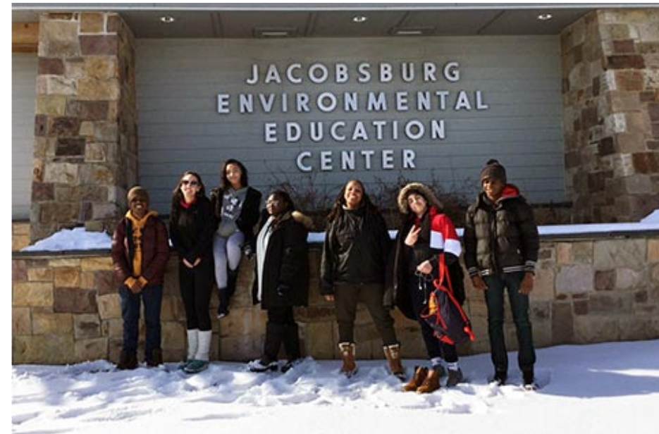
Recently, a group from Philadelphia visited Jacobsburg Environmental Education Center to learn about snowshoeing, forest conservation and stewardship