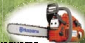
Husqvarna Chain saw