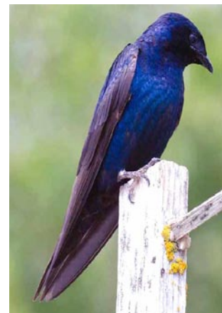
Above - Purple Martin Right - Purple Martin Tower nesting platform

Friends of Minsi Lake Address: P.O. Box 261, Bath, PA 19014 Phone: 610-429-6404 Check us out on Facebook www.facebook.com/foml.org