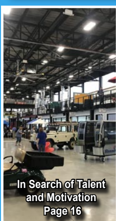
In Search of Talent and Motivation Page 16