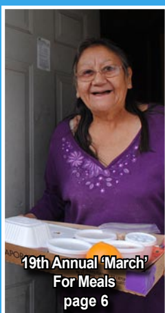
19th Annual 'March' For Meals page 6