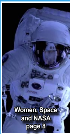
Women, Space and NASA page 8