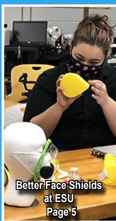
Better Face Shields at ESU Page 5