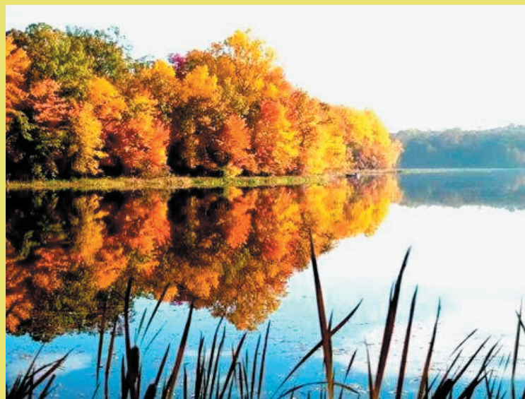
Perfection In Reflection. From My Files Of A Few Years Ago . Views Of Minsi Lake.