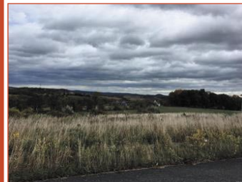
PRIME HOMESITE FOR SALE IN COUNTRY MEWS ESTATES- located in picturesque Washington Township on 1.5 acres of gorgeous farmland. New construction rates are low and building is on the rise. Easy commute to NJ and the Lehigh Valley. You will love the quality-built homes and panoramic views! House packages are available! MLS# 626239 $85,900