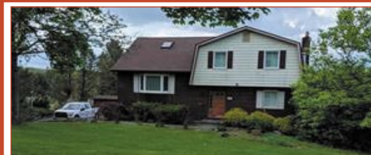
Beautiful, Spacious 4+ bedroom, 3 bath home recently updated. Newly finished family room w/ built in bar, BRAND NEW STUNNING GAS FIREPLACE, full Recreation Room, & All Seasons sun room to enjoy the vast back yard views. The Gourmet kitchen large center island, Granite countertops, & newer HIGH END Stainless Steel Appliances, including a 6 burner gas stove, hardwood floors and quality tile. 2 car garage, storage shed and lots more! MLS# 634179 $285,000

EASTON - Executive Order regarding the detention of undocumented immigrants (attached) WHERE: County of Northampton WHEN: March 3, 2020 Lamont McClure has signed an executive order clarifying Northampton County's position on the detention of undocumented immigrants arrested on suspicion of or adjudicated guilty of a state criminal violation. "Executive Order 20-28 balances the legitimate needs of the Federal Government to enforce our national immigration laws while providing the basic protections of due process that all human beings are owed in the United States," says Lamont McClure.