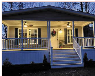
GREAT SPACE! Come & see this BRAND NEW 3-bedroom 2 FULL bath, drywall manufactured home insulated concrete slab foundation, covered front porch, the list goes on. NICE SIZE 28x58'8" Close to entrance and all amenities .Easy carefree living. MLS# 629251 $115,000