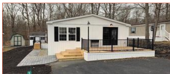
A step above the rest this ultra modern 3 bedroom 2 full bath with bonus front room in Rocky Ridge Estates Manufactured Home Park stainless steel appliances central air spacious deck will not last long. This is a leasehold $500.00 a month which includes water sewer trash road maintenance and community up keep. MLS#631649 $99,900