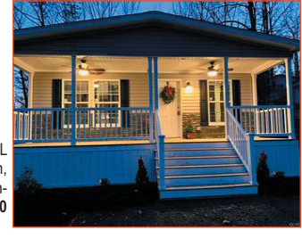
Your Hometown Real Estate Team 2418 N. Delaware Drive. Mt. Bethel PA 18343

GREAT SPACE! Come & see this BRAND NEW 3-bedroom 2 FULL bath. drywall manufactured home insulated concrete slab foundation, covered front porch, the list goes on. NICE SIZE 28x58'8" Close to entrance and all amenities .Easy carefree living. MLS# 629251 $115,000