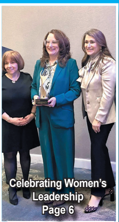
Celebrating Women's Leadership Page 6