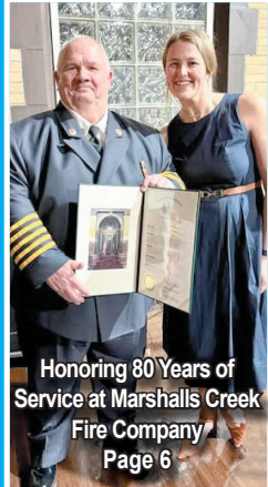
Honoring 80 Years of Service at Marshall's Creek Fire Company Page 6