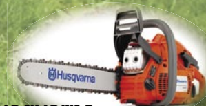
Husqvarna Chain saw