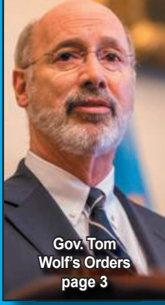
Gov. Tom Wolf's Orders page 3