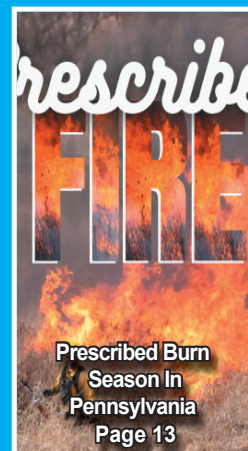
Prescribed Burn Season In Pennsylvania Page 13