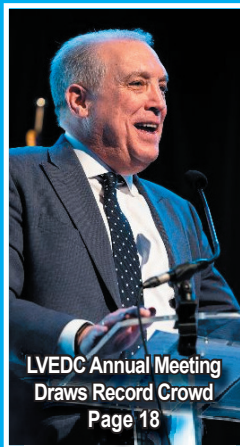
LVEDC Annual Meeting Draws Record Crowd Page 18