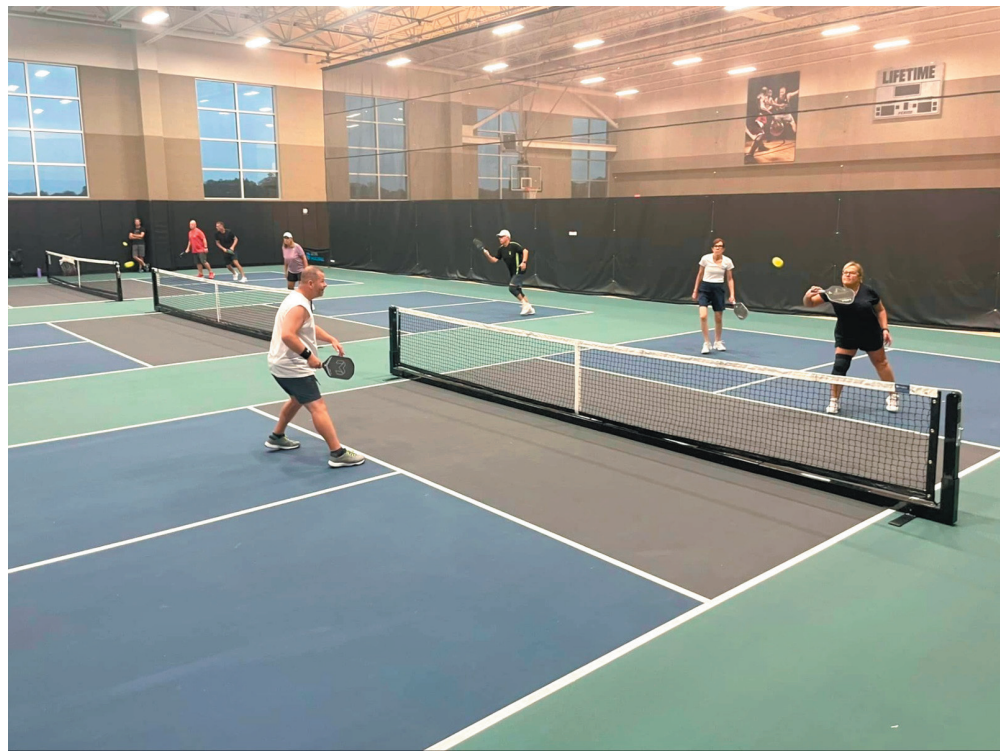
Sample photo of other indoor courts