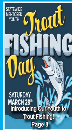
STATEWIDE MENTORED YOUTH Trout FISHING Day SATURDAY, MARCH 29th Introducing Our Youth to Trout Fishing! Page 8