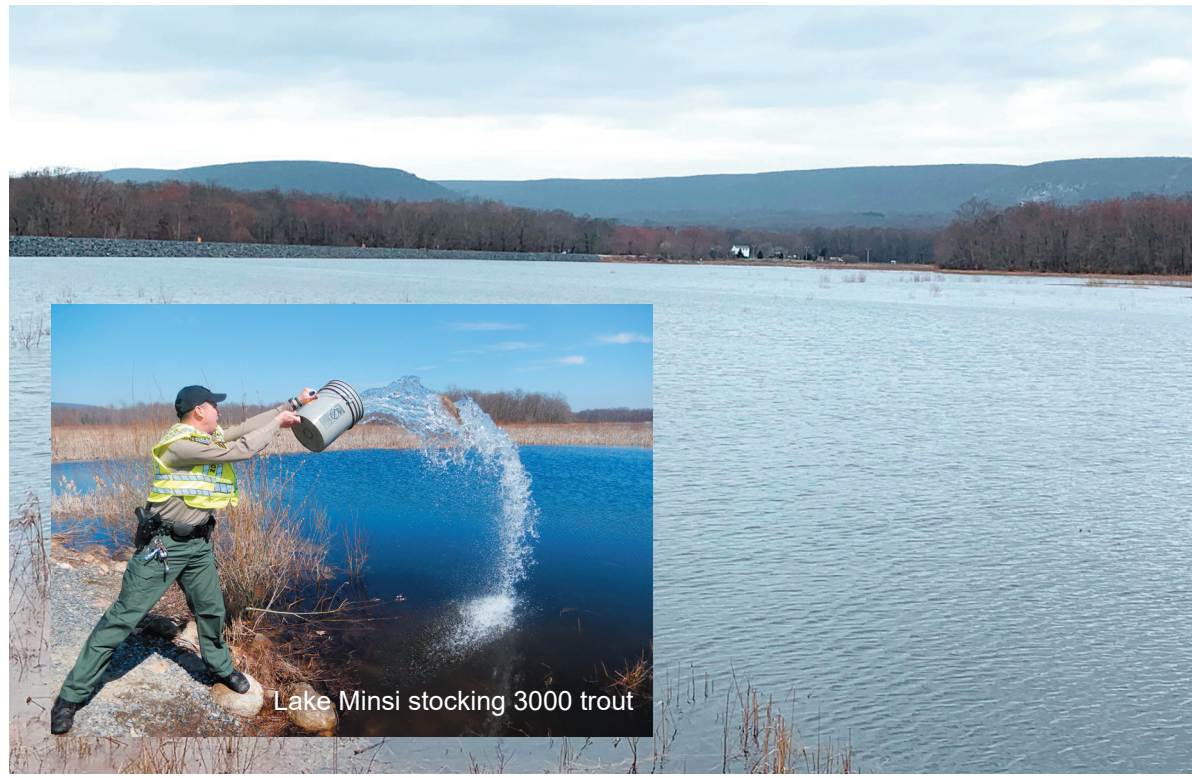
Lake Minsi stocking 3000 trout