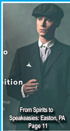
From Spirits to Speakeasies: Easton, PA Page 11