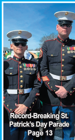
Record-Breaking St. Patrick's Day Parade Page 13

ized with C Page 6 of Public Edu In Pennsylvania School Board Association