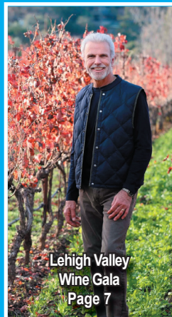
Lehigh Valley Wine Gala Page 7