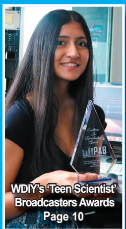
WDIY's 'Teen Scientist' Broadcasters Awards Page 10