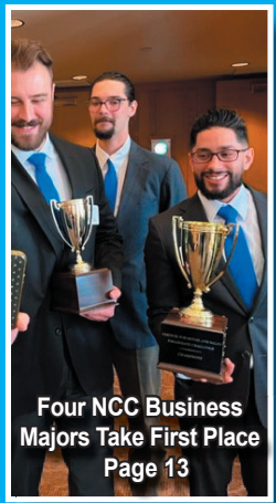
Four NCC Business Majors Take First Place Page 13