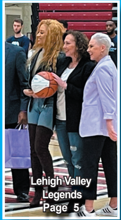
Lehigh Valley Legends Page 5