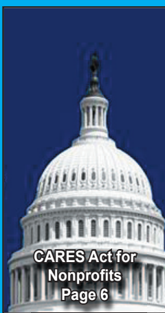
CARES Act for Nonprofits Page 6