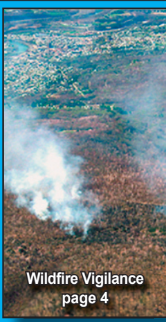
Wildfire Vigilance page 4

SERVING THE SLATE BELT, SOUTHERN POCONOS & NORTHERN N.J. VOL. 29 NO. 14 WEEKLY IN PRINT AND DAILY ONLINE AT WWW.BLUEVALLEYTIMES.COM AND FACEBOOK APRIL 7, 2020