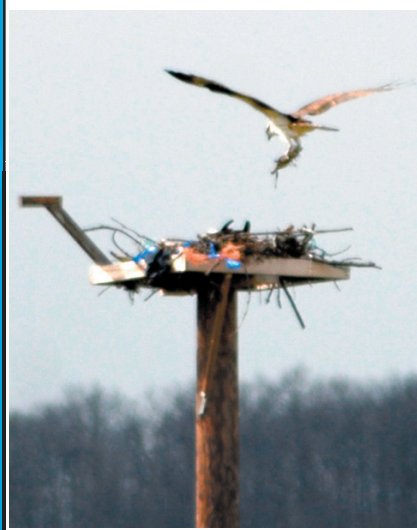
Father Osprey bringing a rodent back to the nest

The best view of the day was the new osprey nest that was installed early this year at Totts Gap. A mother and father finally has made a nest and she has laid her eggs. I was lucky to see the Father feeding the Mother after