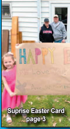
Suprise Easter Card page 3