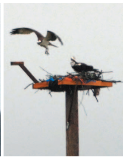
Mother Osprey stretching her wings as she hovers over the nest