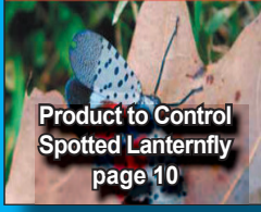
Product to Control Spotted Lanternfly page 10