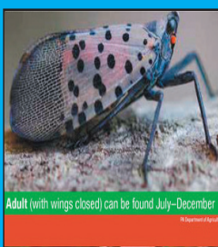
Adult (with wings closed) can be found July-December