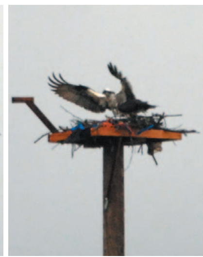
Mother Osprey nestles back down over her eggs