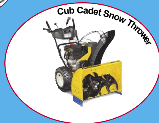
Cub Cadet Snow Thrower

Our selection of off-road and lawn equipment includes Polaris ATVs, Ranger utility vehicles, and snowmobiles; Ski-Doo snowmobiles; Husqvarna power equipment and mowers; Can-Am ATVs, Spyders and UTV's; Scag Commercial Mowers; Cub Cadet lawnmowers and tractors; Yamaha generators and pressure washers.