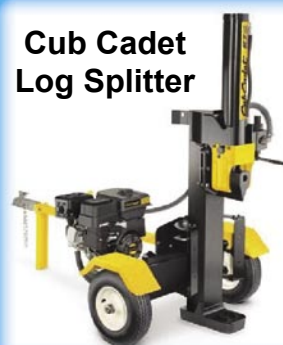
Cub Cadet Log Splitter