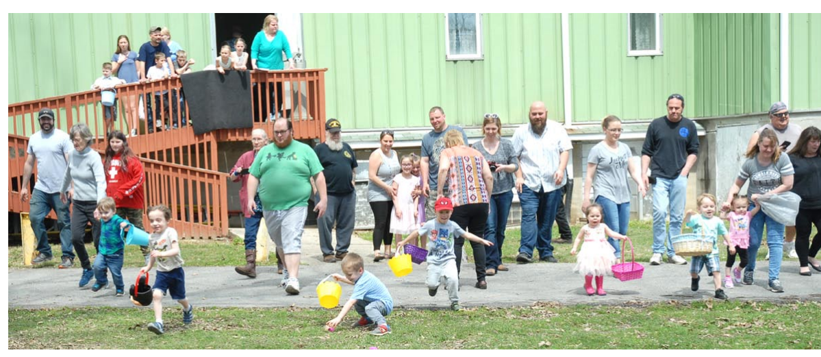
Bangor VFW Egg Hunt Continued from page 1

For more info go to http://www.allied-services.org.