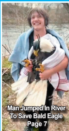
Man Jumped In River To Save Bald Eagle Page 7