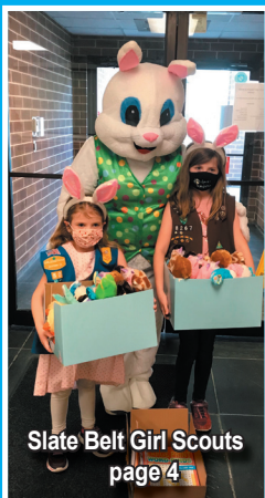
Slate Belt Girl Scouts page 4