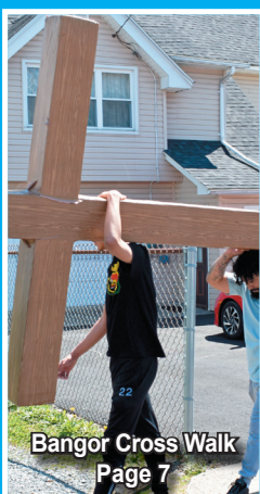
Bangor Cross Walk Page 7