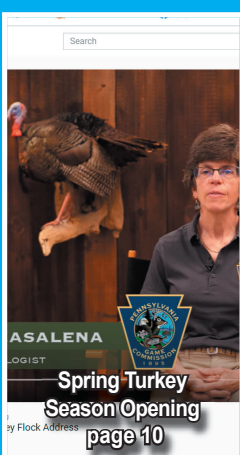
Spring Turkey Season Opening page 10