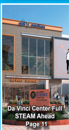
Da Vinci Center Full STEAM Ahead Page 11