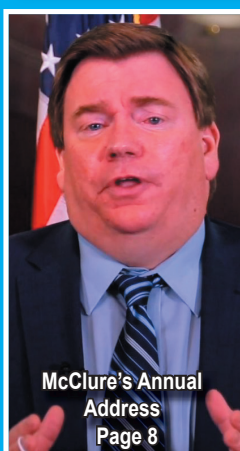
McClure’s Annual Address Page 8