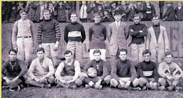
Bangor A.A. Football Team. Group Photo At Flory's Field. Time Period 1909. My Dad Is Seated First Left On First Row.