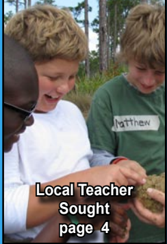
Local Teacher Sought page 4