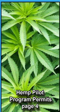
Hemp Pilot Program Permits page 4