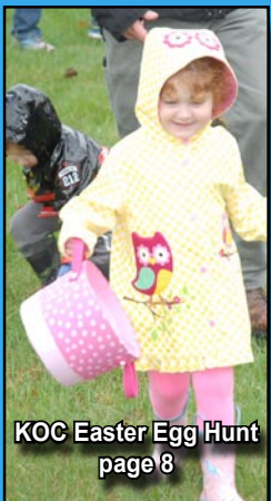
KOC Easter Egg Hunt page 8