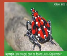
Nymph (late stage) can be found July-September