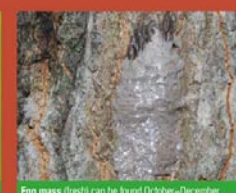
Egg mass (fresh) can be found October-December