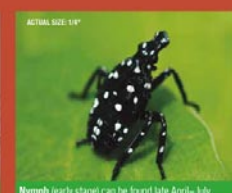
Nymph (early stage) can be found late April-July