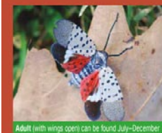
Adult (with wings open) can be found July-December