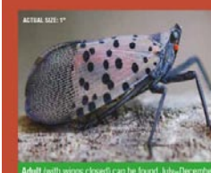
Adult (with wings closed) can be found July-December