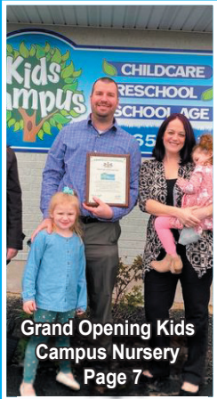
Grand Opening Kids Campus Nursery Page 7