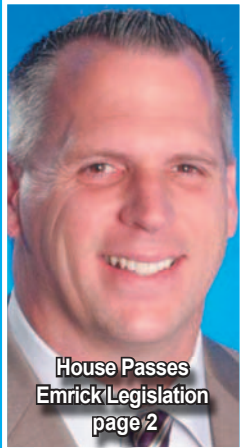
House Passes Emrick Legislation page 2