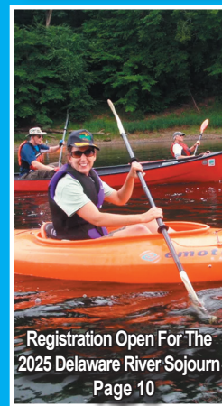
Registration Open For The 2025 Delaware River Sojourn Page 10