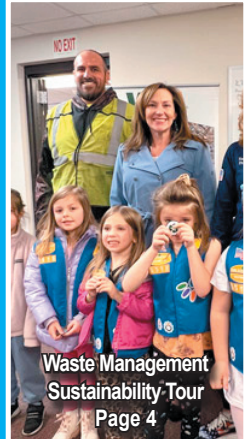
Waste Management Sustainability Tour Page 4