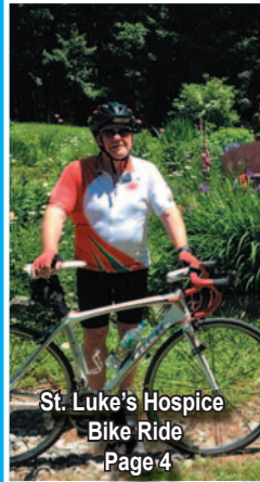
St. Luke's Hospice Bike Ride Page 4