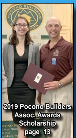
2019 Pocono Builders Assoc. Awards Scholarship page 13