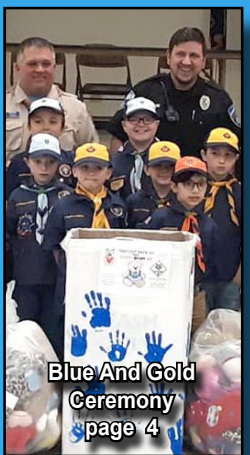
Blue And Gold Ceremony page 4