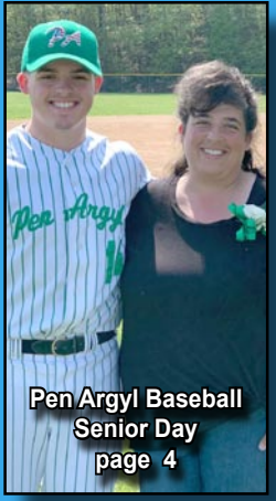
Pen Argyl Baseball Senior Day page 4