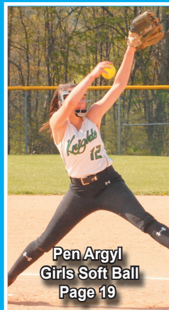
Pen Argyl Girls Soft Ball Page 19