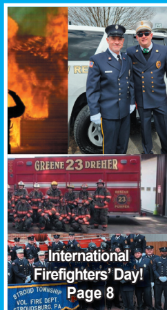
International Firefighters' Day! Page 8