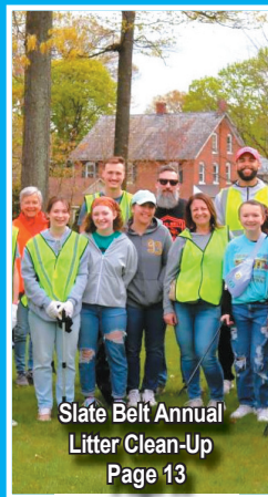
Slate Belt Annual Litter Clean-Up Page 13