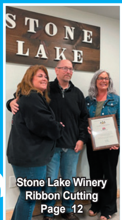
Stone Lake Winery Ribbon Cutting Page 12