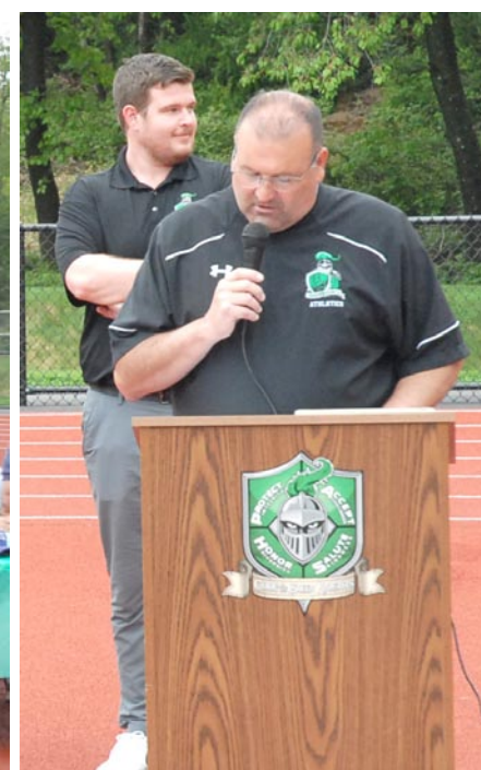
Athletic Director Pen Argyl Area High School