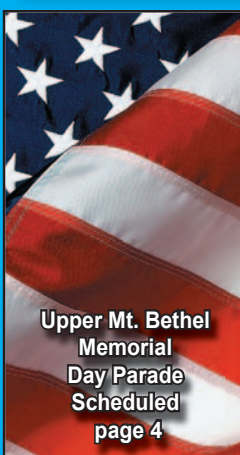
Upper Mt. Bethel Memorial Day Parade Scheduled page 4