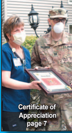
Certificate of Appreciation page 7