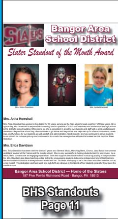
BHS Standouts Page 11