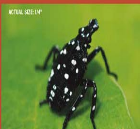
Nymph (early stage) can be found late April–July