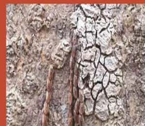
Egg mass (older) can be found January–June