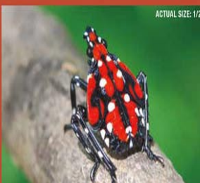
Nymph (late stage) can be found July–September