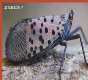
Adult (with wings closed) can be found July–December