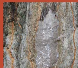
Egg mass (fresh) can be found October–December